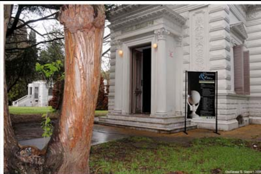
Facultad de Ciencias Astronómicas y Geofísicas Paseo del Bosque s/n 1900 La Plata Pcia. de Buenos Aires Argentina

For more details about the school and the interviews with professors and students, please visit the following web-site: http://www.fcaglp.unlp.edu.ar/extension-y-difusion/boletin-de-noticias-1/boletin-276.-18-de-septiembre-de-2009/boletin-276.-18-de-septiembre-de-2009